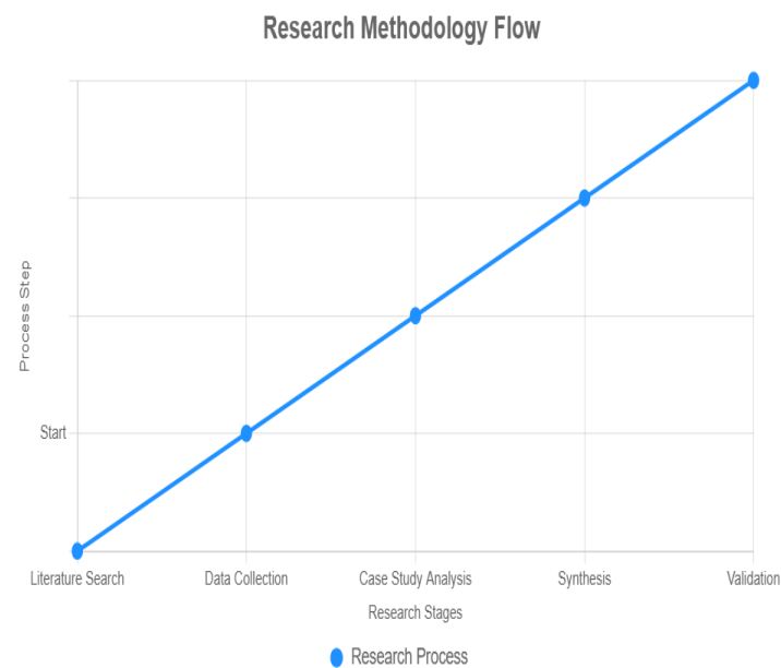
Figure 2: Research Methodology Flowchart

5. Validation: Findings were cross-referenced with recent studies and industry reports to ensure accuracy and relevance. The analysis revealed several key trends that are shaping the future of the industry. These trends include the increasing adoption of artificial intelligence and machine learning technologies, a growing focus on sustainability and environmental responsibility, and the rise of remote work and digital collaboration tools. Furthermore, the research highlighted the importance of adaptability and innovation in maintaining a competitive edge in today's rapidly evolving business landscape.