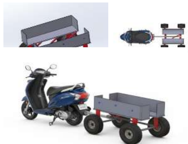
Fig. 2. Reference image of an expandable chassis mounted on a motorcycle for load-carrying application.

After the rider presses the DC motor switch the Sliding Rails will extend horizontally to the user-selected width of the Attachment. The Vertical Support Bars are manually raised to the height necessary to meet their desired location on the deck.