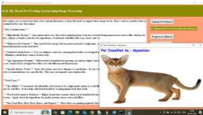
Final Pet Detection Output Image