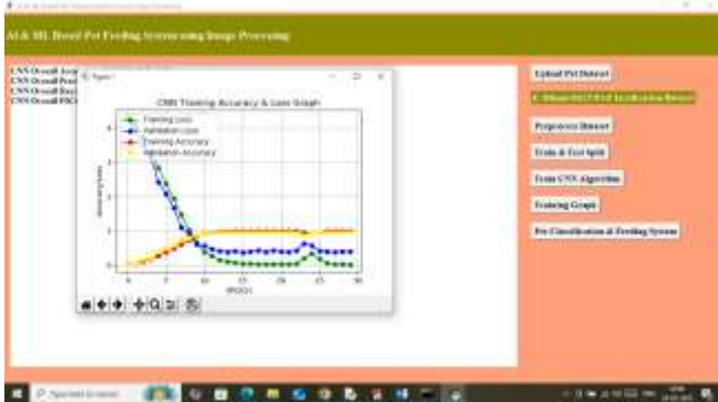
Fig. 2. Final Output Page

Shows training and validation accuracy and loss across epochs, indicating model performance improvement.