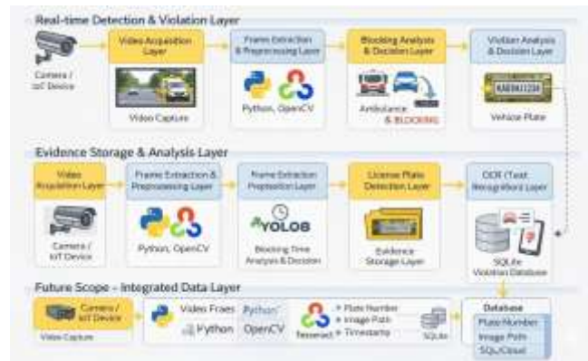
Figure 2: Working of Priority Passage