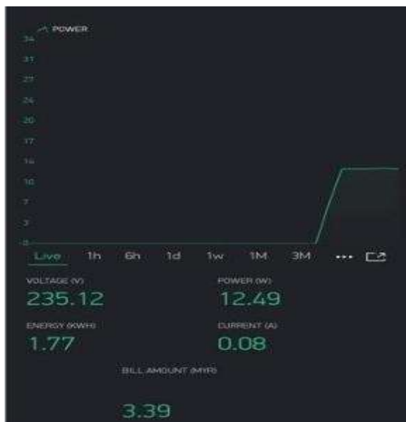
Fig 2 : Blynk Output of Smart Energy Meter