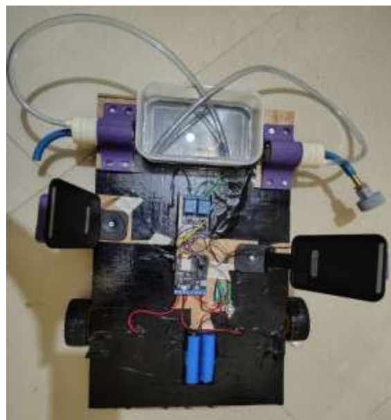
Figure 1 Smart Spraying Rover

Artificial intelligence platforms such as Edge Impulse have significantly improved intelligent embedded systems by enabling TinyML-based machine learning models on low-power microcontrollers. Edge Impulse supports real-time image classification and data processing, making it highly suitable for smart agricultural and rover-based applications.