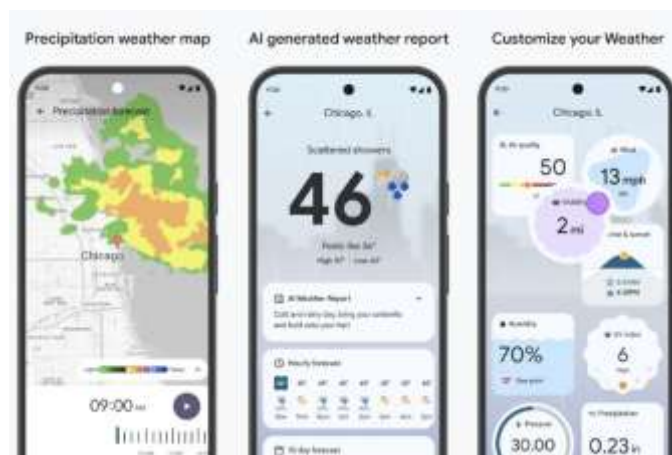
Fig 6.1 Output

The overall testing and implementation results confirmed that the proposed weather application successfully performs real-time weather monitoring and provides accurate environmental information efficiently. The system demonstrated reliable API communication, responsive performance, user-friendly interaction, and successful real-time data processing. The implementation results prove that the proposed application is suitable for practical weather monitoring and daily environmental information access.